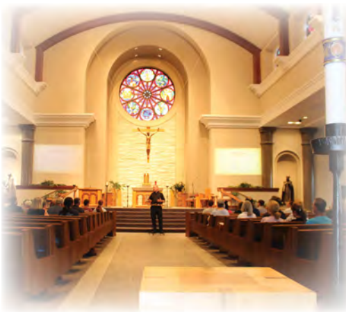
'Overview of the Catholic Faith' in the Church on August 29, 2024.

God calls many to the Catholic Faith at Assumption